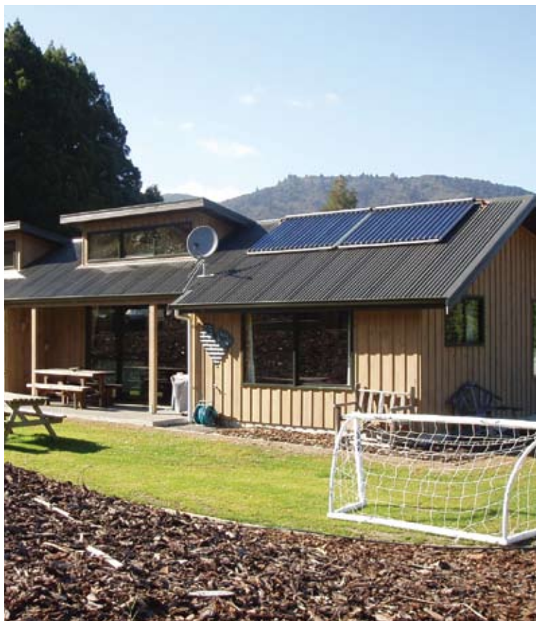
Eco Lodge Staff Accommodation