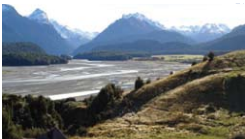
Potential site, Paradise, Glenorchy

It is currently planned that timing for the first intake will coincide with the 50th Anniversaries of Outward Bound in New Zealand and UWC globally in 2012.